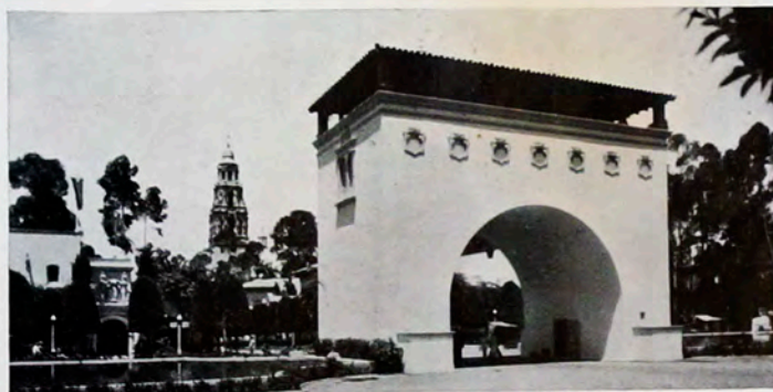
The Arch Way

● Ford Bowl and Music