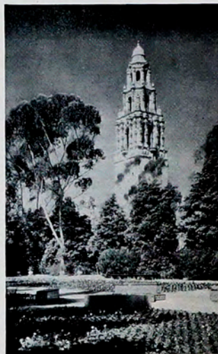
California Tower—Alcazar Gardens