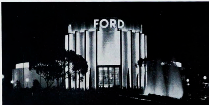
Ford Building at Night

Gold Gulch recreates the colorful days of '49 and the California gold rush. It is located in a deep ravine and bearded miners pan gold in settings reminiscent of the famous mining camps. Here also is the Sheriff's office, iron barred bank, general store, "First Chance" saloon, stamp mill and shacks which are only a few of the many buildings that reproduce the olden, golden days when the cry of gold brought men to California from all parts of the world.