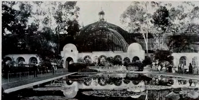
Botanical Building and Lagoon

One of the high spots of interest is the Exposition Zoological Gardens housing 2,500 animals, birds and reptiles, among which are to be found many rare specimens.