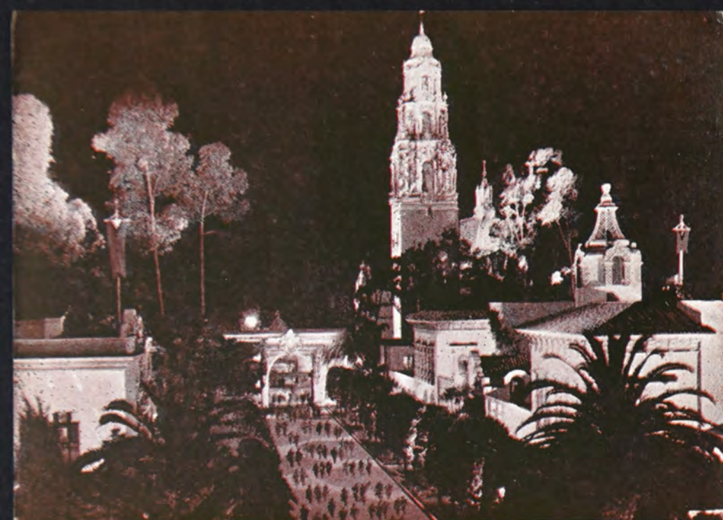
California Tower Crowns Avenue of Palaces