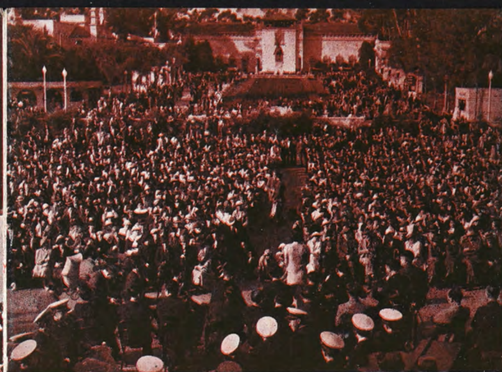
Free Musical Concerts Delight Thousands