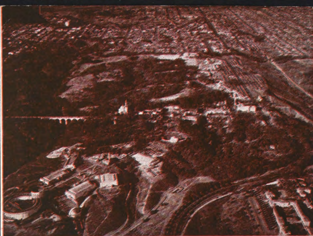
Aerial View of Exposition Palisades and City