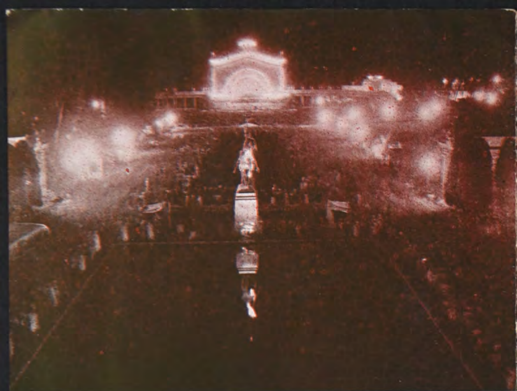
Multitudes Assemble in Plaza del Pacifico